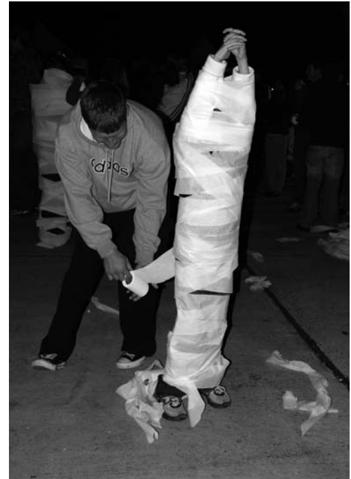
Relay participants get 'wrapped up' in last year's Mummy Relay event.